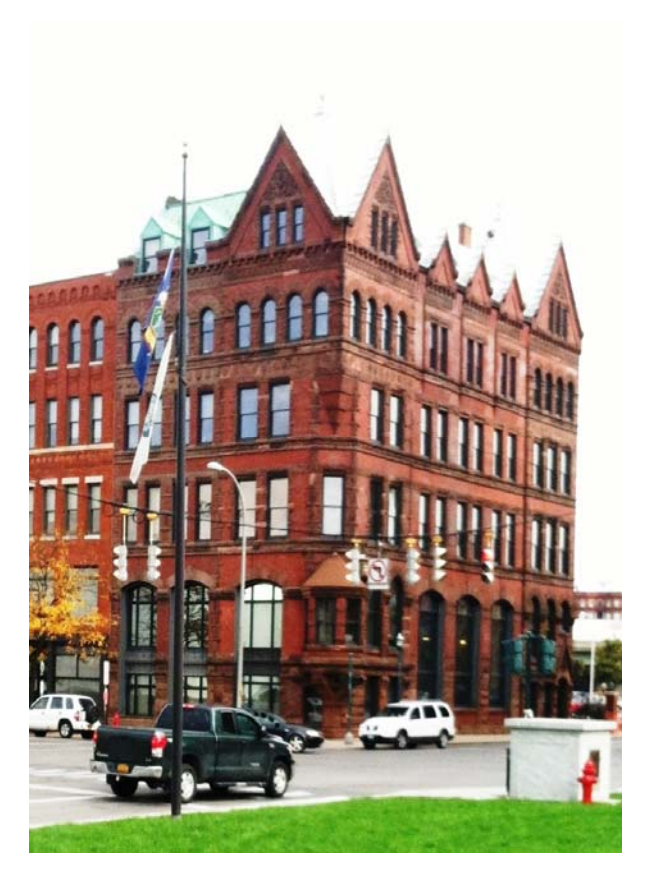
THE THIRD NATIONAL BANK FOUNDED BY