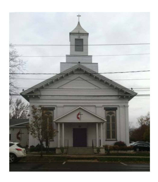
The Liverpool Methodist Church The church with "The Purple Doors"